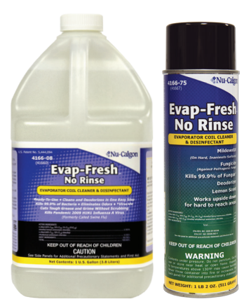
EPA Registered to Clean & Disinfect

A high performing, heavy duty detergent. It is formulated with special surfactants and alkaline cleaners that have been developed into a foaming, no-rinse product. Evap Foam is ideal for use on most coils, but it is particularly suited for use on cooling or evaporator coils. Can be sprayed either right side up or upside down.