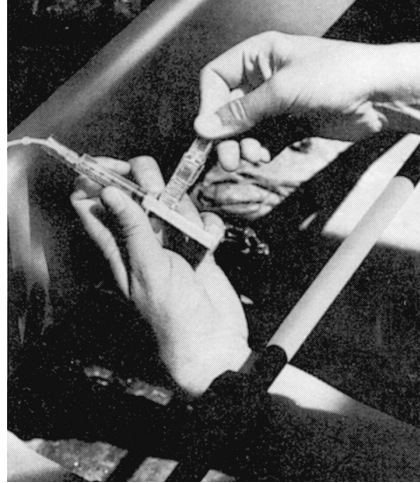
Use syringe to charge Drip Feeder.